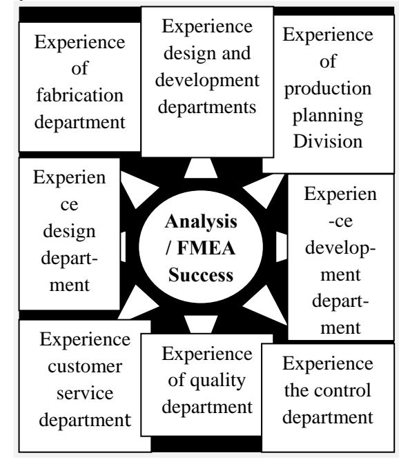
Figure 2: Analysis/ Fmea's success in order to ensure the quality of a product.

During this phase, the guidelines have been established that will be subject to analysis of FMEA in the light of the criteria for use [2]. This team of experts helps the team to deepen analysis FMEA.